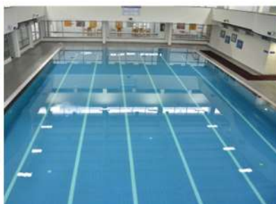
Swimming pool at the Sports Centre